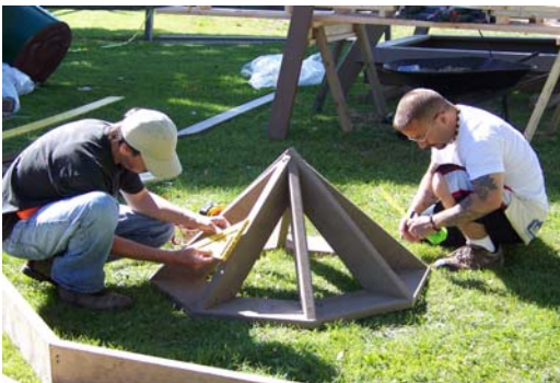
Building a swing at Myers Point

This year in addition to those service opportunities CARS was a part of some very important community projects such as the Myers Point Playground Build, the T-burg Farmer's Market Pavilion construction project and the Trumansburg School Playground Build.