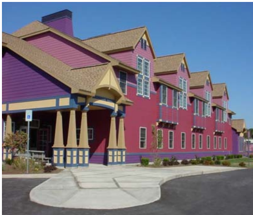
CARS Residential Facility

Cayuga Addiction Recovery Services PO Box 724 Trumansburg, NY 14886