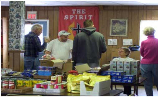
Helping out at Reynoldsville UMC food pantry

Throughout the year we seek service opportunities for our clients as they begin the process of transformation. Every week, residents of CARS residential addiction treatment program in Trumansburg volunteer at the food pantry sponsored by Trumansburg area Council of Churches. In other service projects, clients from CARS spend some time socializing at Juniper Manor Elder Housing in Trumansburg, do landscaping work at Hospicare and work at the Reynoldsville UMC Food Pantry.