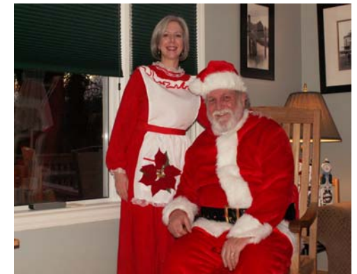
The author and his wife as Mr. & Mrs. Claus