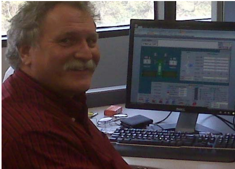
The author at work

December 27, 1971 was the beginning of the end for me. Not that this was a bad thing, given the life style I had lived the previous 8 years. I was just 20 years old then, but like I told the sentencing judge in February 1972; I felt like I was 80. I was 80, and closer to death than one could possibly imagine. I knew that there were few choices available to me then. I was certain to face; prison, death, and /or self – destruction, without some sort of real concerned intervention. That life style did come to an end for me that December day. Thanks to a few people who really cared; a Judge, a Probation Officer, an Attorney, a District Attorney and the man that started Alpha House.