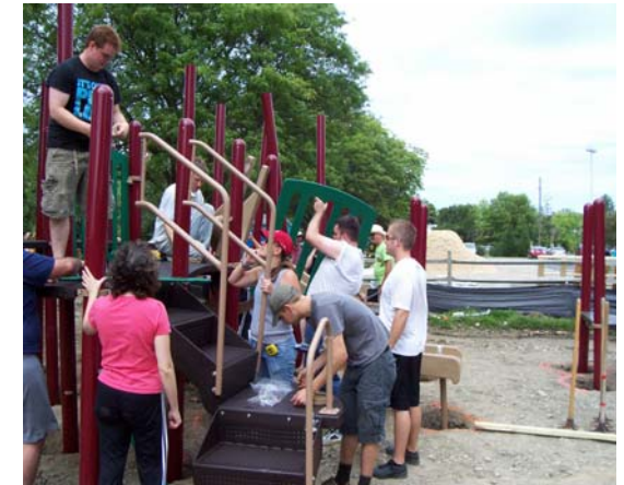
CARS clients at work on the school playground project

In terms of service activity for 2010, our Outpatient program served 490 clients and provided 16,362 patient visits. Our Supportive Living Program served 45 clients, completing 5,911 days of client care. Finally, our residential facility served 207 clients and provided 19,817 days of client care. We have also had the privilege to work with many local and regional community partners including Tompkins Co. Mental Health and our local treatment court teams to make lasting and effective change for the clients we serve.